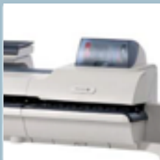
Manage inbound deliveries.